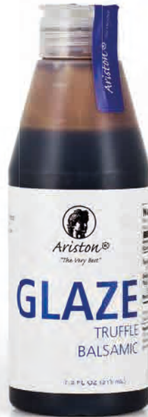
Ariston Truffle Balsamic Glaze