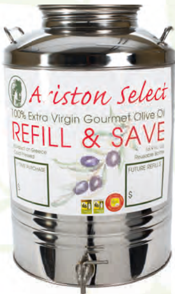
Ariston Select Extra Virgin Olive Oil