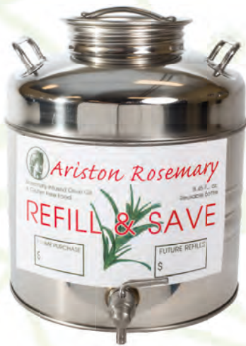
Ariston Rosemary Infused Olive Oil