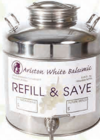
Ariston White Balsamic