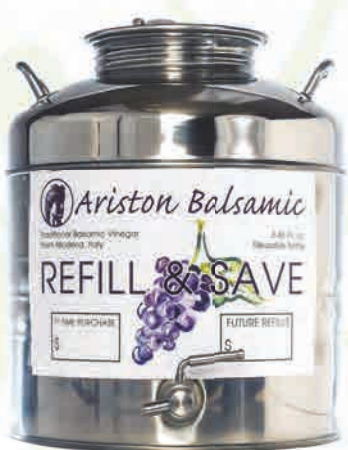
Ariston Balsamic Vinegar