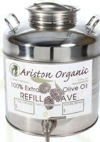
Ariston Organic Extra Virgin Olive Oil