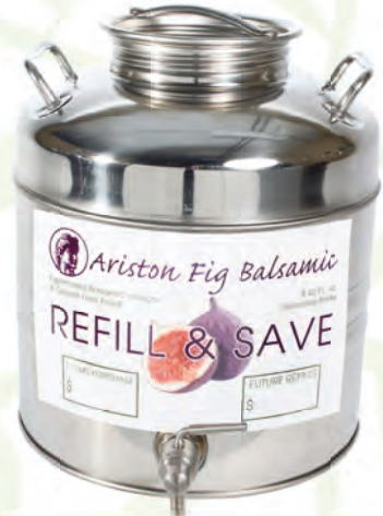
Ariston Fig Balsamic