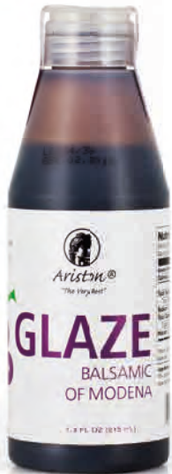
Ariston Traditional Balsamic Glaze

Syrupy, sweet, delicious and tangy these glazes takes out the guess work & time in reducing balsamic vinegar. Great for anyone that wants to create a quick and easy culinary masterpiece!