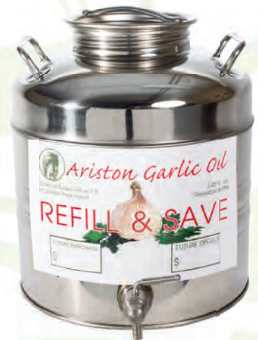
Ariston Garlic Infused Olive Oil