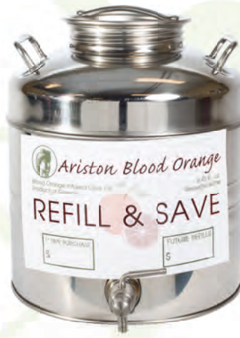
Ariston Blood Orange Infused Olive Oil