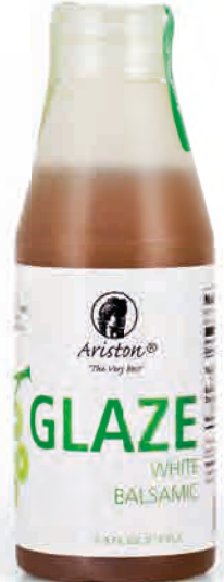
Ariston White Balsamic Glaze