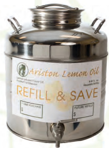
Ariston Lemon Infused Olive Oil