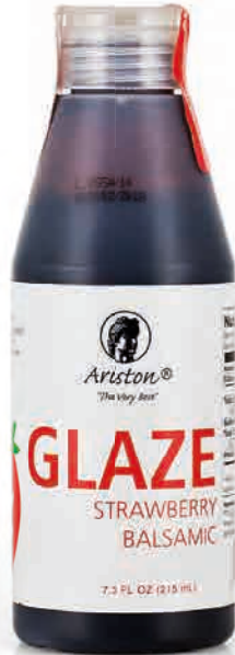
Ariston Strawberry Balsamic Glaze