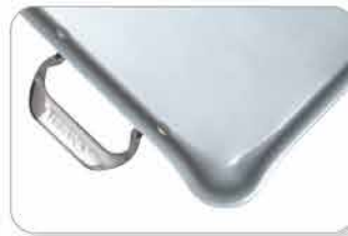
Convenient pouring spout