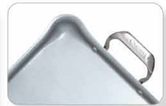
Available uncoated or with PFOA/PFOS-Free nonstick coating

Excellent for pancakes, bacon, burgers, quesadillas and more! Stovetop and oven safe up to 500°F/260°C.