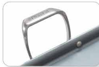
Unique offset handles