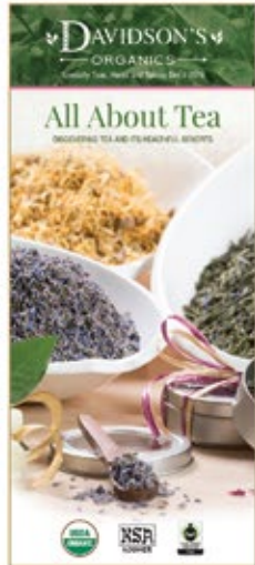
"All About Tea" Brochure