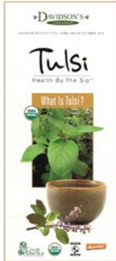
"What is Tulsi?" Brochure