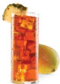
Decaffeinated Tropical Ice