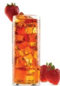
Decaffeinated Strawberry Ice