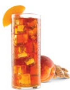
Ginger Peach Ice