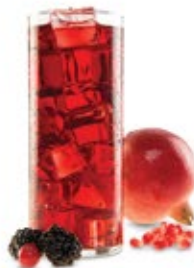
Pomegranate Berry Ice*