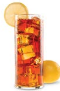
Decaffeinated Ceylon Ice