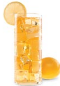
Lemon Ginseng Green Ice