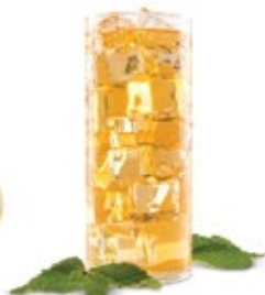
Moroccan Mint Ice