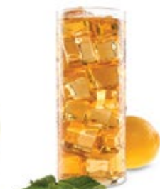
Tulsi Pure Leaves Ice*