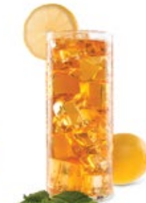
Herbal Lemon Spearmint Ice*