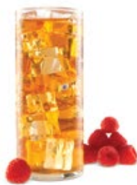
White Raspberry Ice