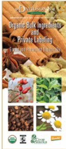
Bulk Ingredients & Private Labeling Brochure