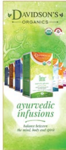
Ayurvedic Infusions Brochure