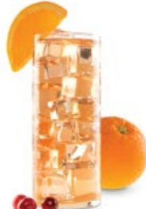
Herbal Cranberry Orange Ice*