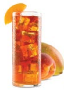
Mango Peach Ice