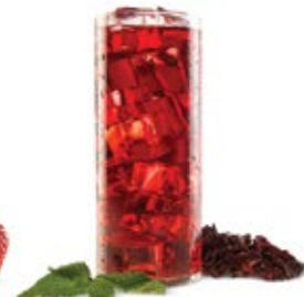
Té De Hibiscus Ice*