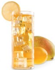
Green with Mango & Citrus Ice